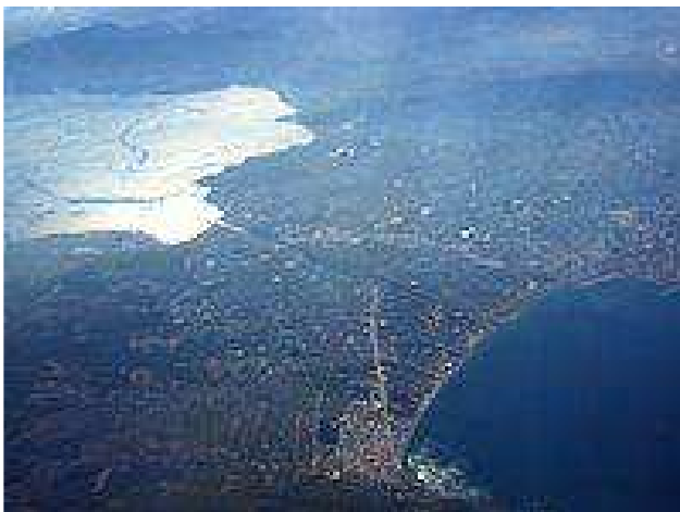
Isthmus of Corinth

Isthmus of Corinth used as common trade route to bring goods from Italy and Spain to the west and from Asia Minor to Phoenicia and Egypt.