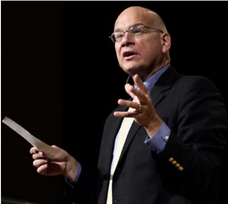
Dr. Timothy Keller

total freedom = lack of meaning and significance