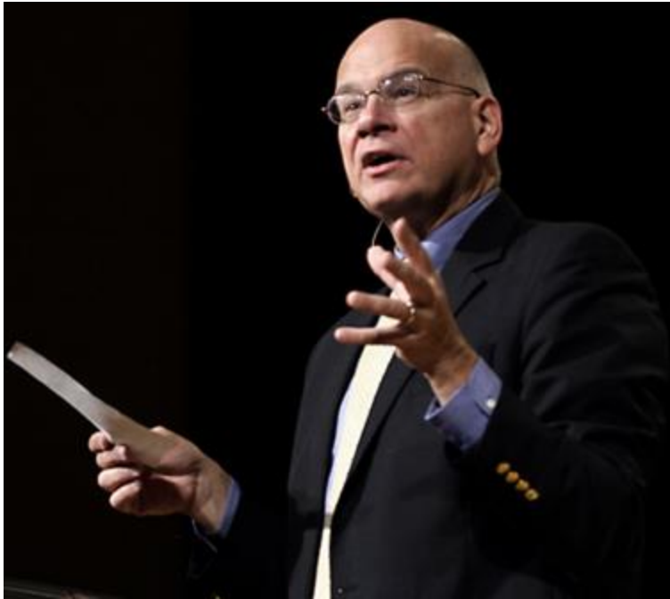
Dr. Timothy Keller

total freedom = lack of meaning and significance